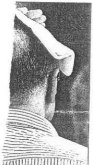
Mercury remained temperature was